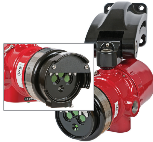
Figure 2: Environmental protection accessories on flame detectors, such as the shields shown on the Det-Tronics X3301 multispectrum detector above, can help reduce maintenance requirements.

In areas where heavy rain is accompanied by strong winds, there is no physical way to prevent precipitation from accumulating on the detector's optics. Eventually, this accumulation will cause a significant reduction in the