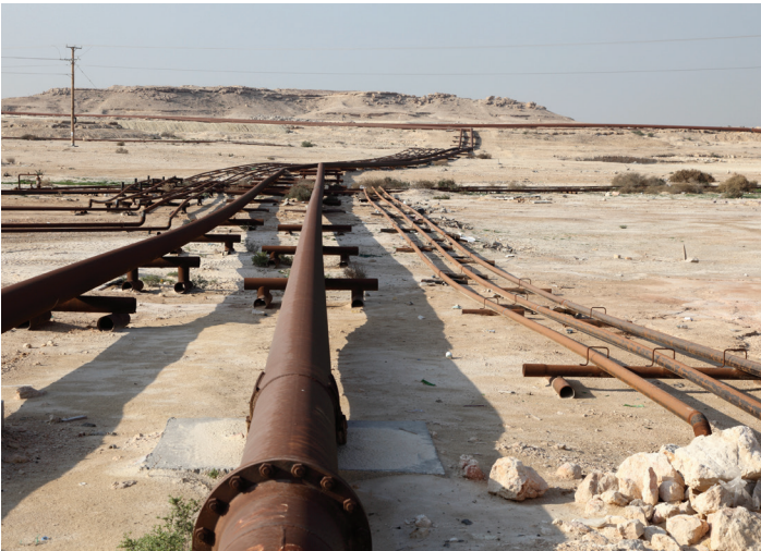
Detectors installed in harsh desert environments should reliably perform across a wide range of temperatures, and their housings should be tightly sealed to protect sensitive components from harmful dust.

Class I/Zone 1 locations — and particularly those in extreme environments — call for detector designs that take into account the explosive and flammable potential of surrounding hazardous substances. These devices need to meet the fire- and explosion-specific standards established by organizations such as FM Approvals, Underwriters Laboratories and International Electrotechnical Commission (IEC), which require that equipment designs be certified to remain explosion-proof at the temperature range the manufacturer states the detectors can operate in. This means the detector housings must contain internal explosions so that hot gas and other byproducts cannot escape and ignite surrounding hazardous substances. For example, housings for explosion-proof detectors must be certified to ensure that they will not change in extreme temperatures, creating small gaps which may not contain an internal explosion.