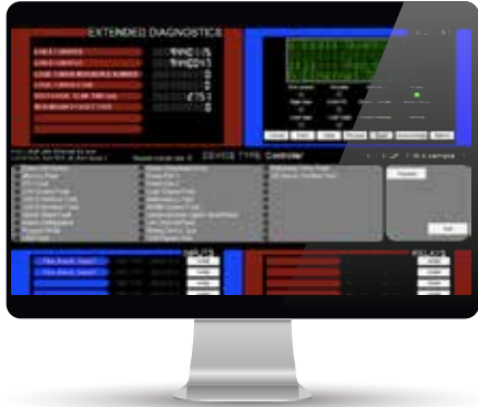
Safety system software provides real-time status and diagnostics.

“We have had a Det-Tronics fire and gas safety system installed for over 10 years. The diagnostics have been excellent, and provide me the information I need when I need it.”— Instrument and Electrical Specialist, Energy Company