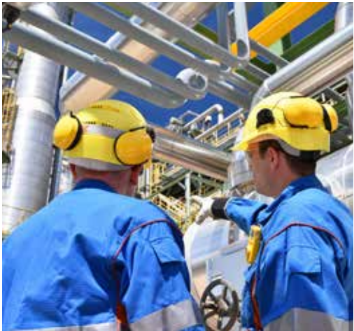
After your system is in place, our global network provides service, training, and support at your site.