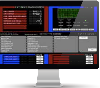
Safety system software provides real-time status and diagnostics.

“We have had a Det-Tronics fire and gas safety system installed for over 10 years. The diagnostics have been excellent, and provide me the information I need when I need it.”— Instrument and Electrical Specialist, Energy Company