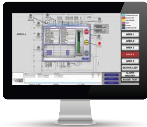
Integrate with existing site control systems such as SCADA, DCS and Process PLC

“We have had a Det-Tronics fire and gas safety system installed for over 10 years. The diagnostics have been excellent, and provide me the information I need when I need it.”— Instrument and Electrical Specialist, Energy Company