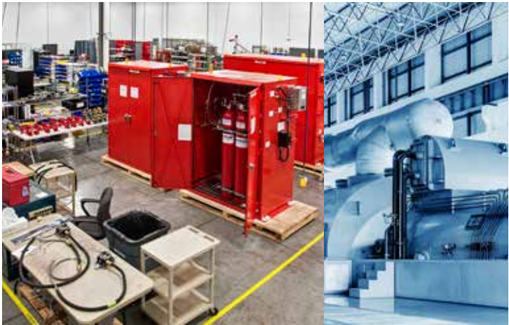
Before your system arrives, our experts define, engineer and integrate your solution.

“We use Det-Tronics for their expertise for fire and gas mapping. The big benefit is the peace of mind knowing that the detection equipment is located properly.”— Plant Manager, Natural Gas Processor