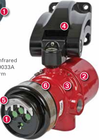
X3301 Multispectrum Infrared Flame Detector with Q9033A Aluminum Mounting Arm