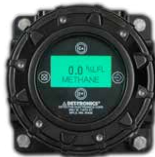
NEW PRODUCT FlexVu® UD30 Universal Display with easy-to-read screen