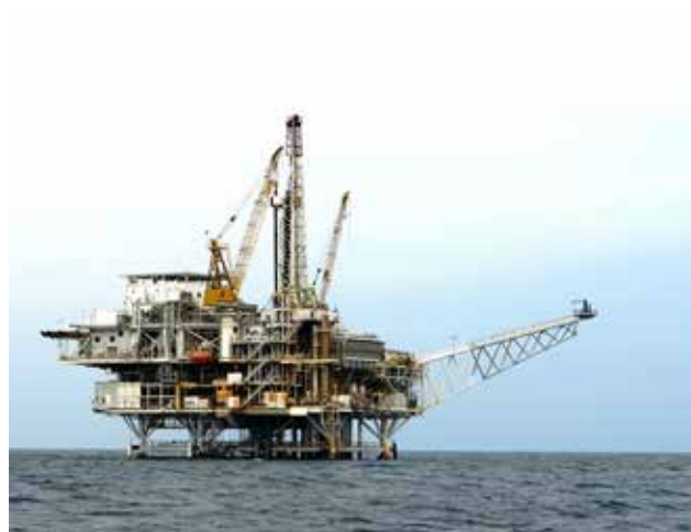
Solutions are tested before being commissioned