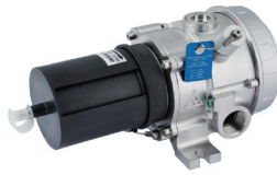
PointWatch Eclipse® IR Combustible Gas Detector