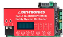
Eagle Quantum Premier® Safety System