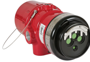
X-SERIES FLAME DETECTORS