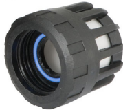
GTS Replacement Filter