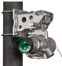
FLEXSIGHT™ LS2000 LINE-OF-SIGHT DETECTORS