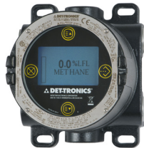
FLEXVU® UD10/UD20 UNIVERSAL DISPLAYS