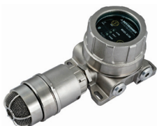
FlexSonic® Acoustic Leak Detector

Learn more about these products at www.det-tronics.com or speak to your local representative.