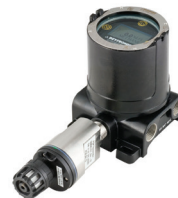
FlexVu® Universal Display with GT3000 Toxic Gas Detector