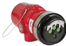
X3301 Multispectrum IR Flame Detector