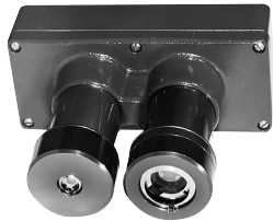
LEGACY FLAME DETECTORS