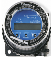
LEGACY TX (U9500) DISPLAYS