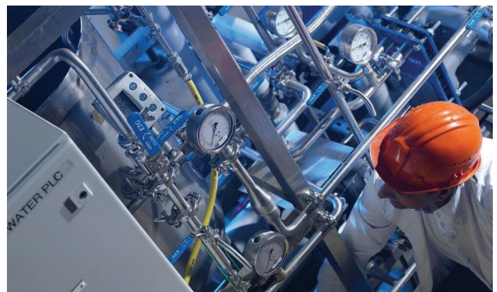
Industrial processes, usually controlled by a PCS, also need to be protected by an F&G safety system that can detect and provide a warning of hazardous conditions.

An F&G safety system is composed of several subsystems that can include, but are not limited to, flame, gas and smoke detection, a safety system controller, and notification and/or suppression-activation devices.