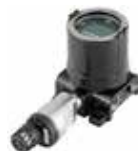
FlexVu® Universal Display with GT3000 Toxic Gas Detector