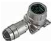
FlexSonic® Acoustic Leak Detector