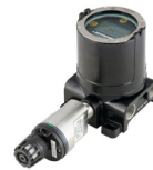
FlexVu® Universal Display with GT3000 Toxic Gas Detector