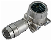
FlexSonic® Acoustic Leak Detector