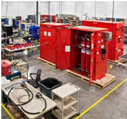
Before your system arrives, our experts define, engineer and integrate your solution.

“We use Det-Tronics for their expertise for fire and gas mapping. The big benefit is the peace of mind knowing that the detection equipment is located properly.”— Plant Manager, Natural Gas Processor