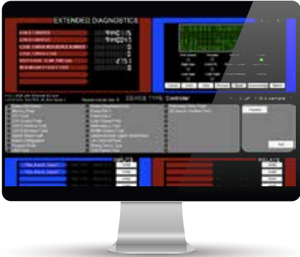
Safety system software provides real-time status and diagnostics.

“We have had a Det-Tronics fire and gas safety system installed for over 10 years. The diagnostics have been excellent, and provide me the information I need when I need it.”— Instrument and Electrical Specialist, Energy Company