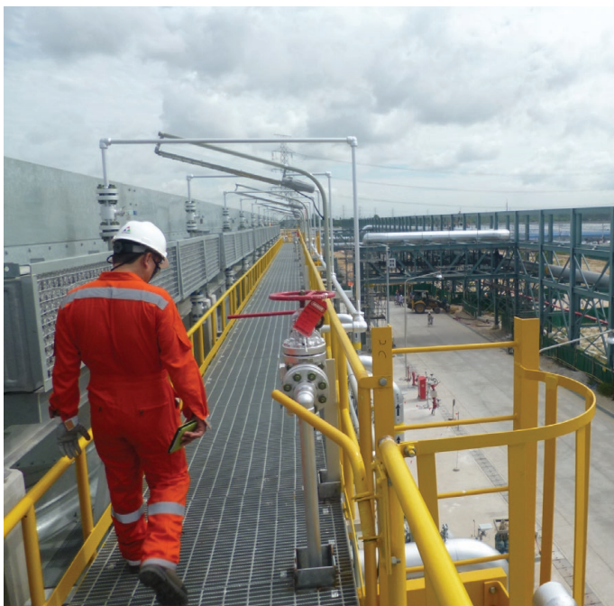
It is important to conduct a fire hazard analysis to determine the hazards present in a facility and their potential consequences.

Best practices are defined as professional procedures shown by research and experience to produce optimal results. While a number of organizations such as the