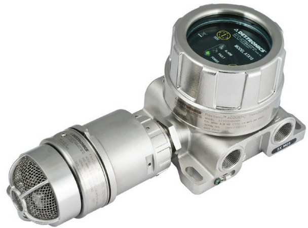
Figure 2: The Det-Tronics FlexSonic® acoustic gas leak detector includes a high-fidelity microphone capable of continuously checking for the distinct ultrasound emitted by pressurized gas leaks across the widest spectrum of frequencies, while ignoring nuisance ultrasonic sources in the environment that could cause false alarms.

LOS detectors should be mounted to a rigid and stable surface so the optical alignment of the transmitter and receiver is maintained consistently. In addition, component placement must be performed carefully as the system requires an unobstructed line of sight between the transmitter and receiver. Many LOS detectors are self-monitoring and will alert users in the