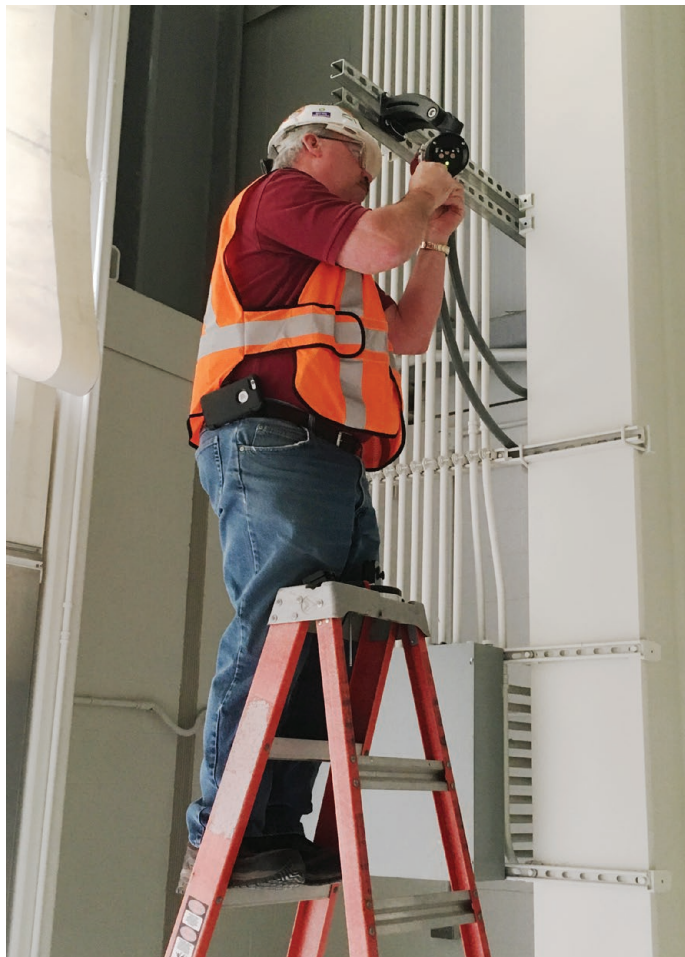
Optical flame detectors, such as the Det-Tronics X3301 MSIR detector shown above, should be aimed carefully to optimize performance.

In order to optimize a flame detector's false alarm rejection performance, it is preferred that the detector's FOV be controlled to the area that requires flame detection monitoring. Sources of intense IR emissions should be eliminated from the detector's FOV whenever possible. Controlling the detector's FOV through