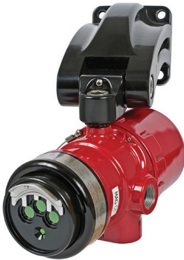
Figure 3: Advanced flame detectors, such as the DET-Tronics X3301 IR flame detector shown, conduct automatic fail-safe checks every 60 seconds to verify the device's optic operation with no test lamp required.

Flame performance testing can determine a detector's coverage area or field of view (FOV). Accurate FOV data allows the designer to locate detectors more effectively and efficiently. In most cases, the greater a detector's range and FOV, the fewer devices a plant will need to achieve its required coverage. Flame detectors require a clear line of sight to the area being protected, so proper detector placement, without obstructions, is important. Consult the product instruction manual to obtain detailed information about the types and sizes of fires a particular detector can detect.