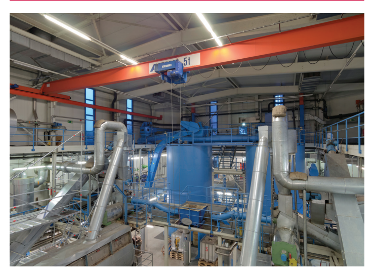
Sludge dewatering is one of the wastewater treatment stages specifically called out in NFPA 820 for fire protection including smoke detectors.

Each of these detection technologies has benefits and limitations, depending on the specific application and environmental factors. So an optimal solution may involve the use of more than one of them, with the different technologies placed in locations that maximize their effectiveness.