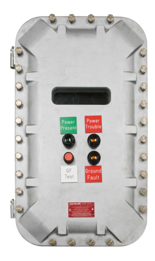
Figure 1—External View of EQ3900RPS