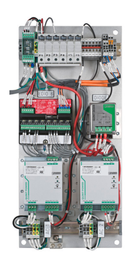
Figure 2—Internal View of EQ3900RPS