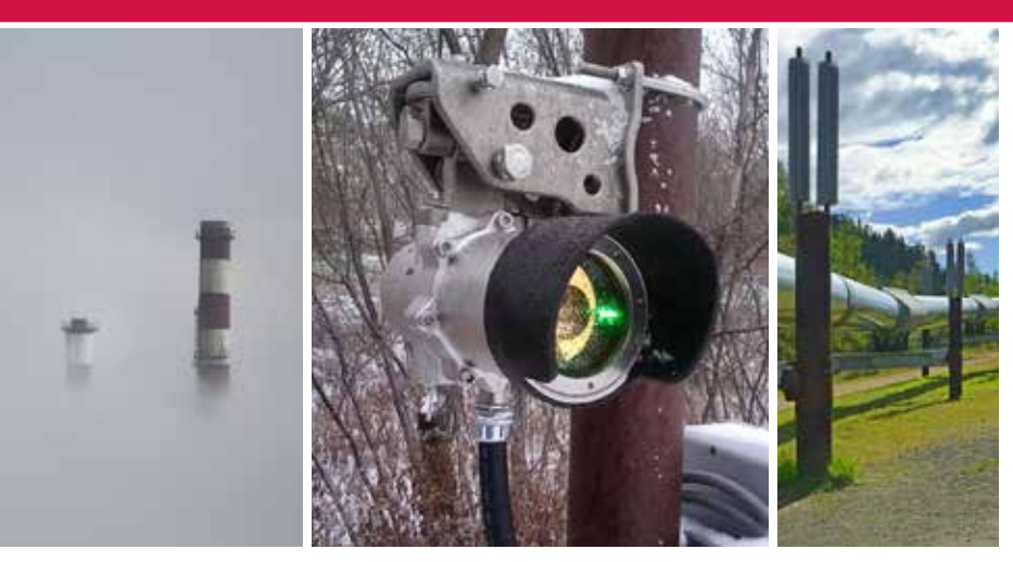
Det-Tronics FlexSight™ LS2000 line-of-sight infrared gas detector is third-party certified and is SIL 2 capable.