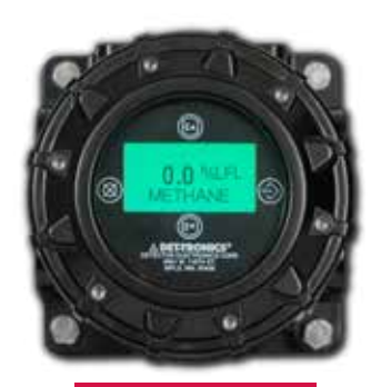
NEW PRODUCT FlexVu® UD30 Universal Display with easy-to-read screen