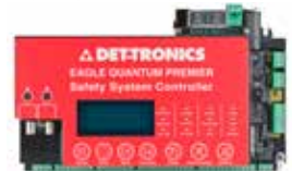
Eagle Quantum Premier® Safety System