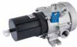
PointWatch Eclipse® IR Combustible Gas Detector