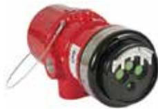
X3301 Multispectrum IR Flame Detector