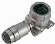
FlexSonic® Acoustic Leak Detector