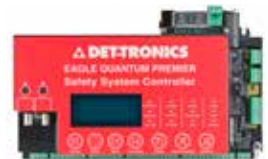
Eagle Quantum Premier® Safety System