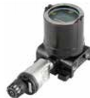
FlexVu® Universal Display with GT3000 Toxic Gas Detector