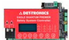
Eagle Quantum Premier® Safety System