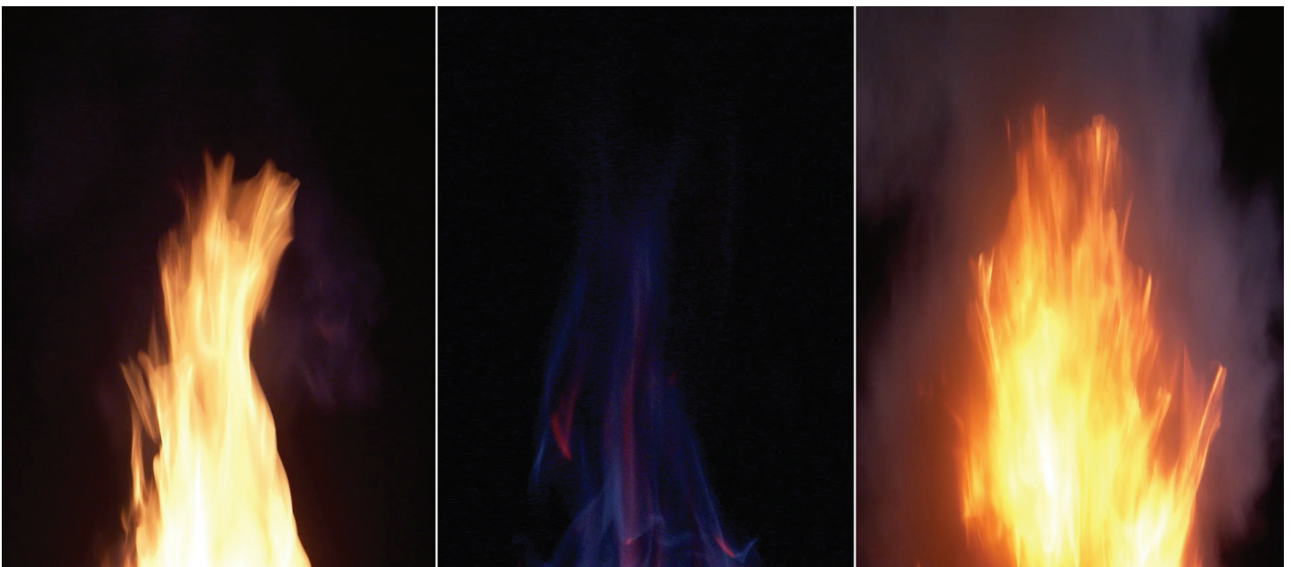
Figure 2: Every combustible gas burns differently, producing a signature flame. Compared to hydrocarbon flames depicted on the right and left above, a hydrogen flame (center) emits little visible light and IR radiant heat and therefore is more difficult for people and equipment to detect.

This makes catalytic bead-type detectors the right choice for detecting hydrogen at lower flammable limit (LFL) levels. A catalytic bead sensor detects any combustible gas that combines with oxygen to produce heat. If the gas can burn in the air, this sensor will detect it.