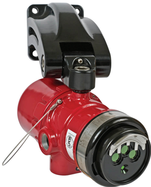
Figure 3: To “see” hydrogen flames, today’s best technology is multispectrum infrared flame detection as used in the new Det-Tronics X3302 MIR IR flame detector shown.

On the downside, the range of MIR flame detectors is reduced by the presence of water or ice on the lens. To mitigate this problem, some detectors are equipped with lens heaters that melt ice and accelerate evaporation of water.