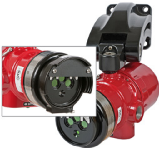
Figure 1: Heavy wind, rain or snow can lead to weather-induced fault conditions for flame detectors because infrared radiation is absorbed by water molecules. To minimize the accumulation of moisture or condensation on detector optics, look for IR detectors with lens heaters and device shielding (as shown on the Det-Tronics X3301 Multispectrum IR detector above).

Installation techniques can also help minimize the impact of precipitation on optical flame detector performance. Since detectors usually monitor processes at or below their level, users can aim detectors down 10–20 degrees.