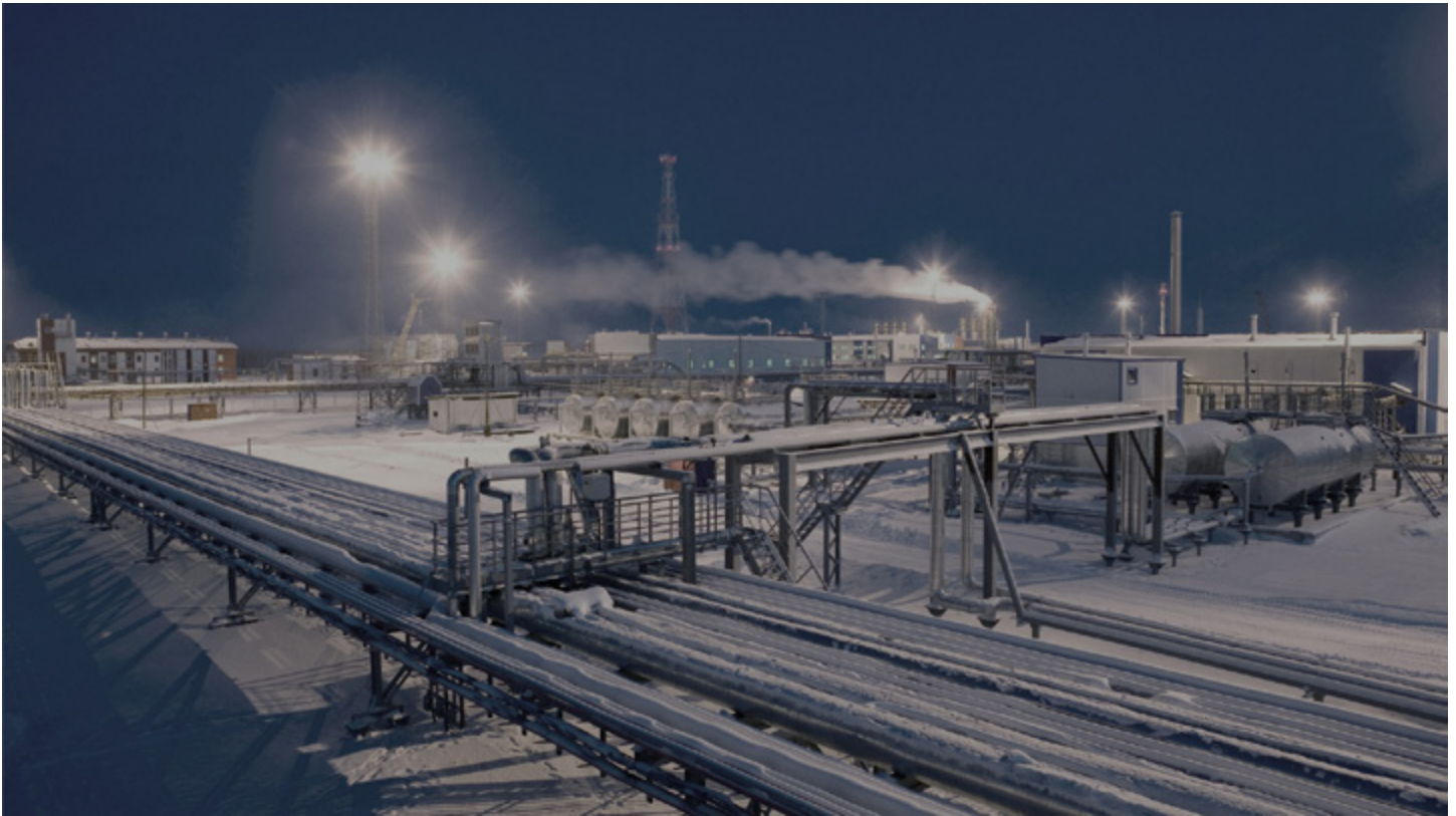
Located above the Arctic Circle, Yamal is a ground-breaking project to develop the huge condensate gas fields in the Russian Yamal peninsula. Extreme cold and winds, long periods of darkness, snowfall that never melts, and fog and mist that accumulate and freeze on equipment combine to require high-performance technology such as the Det-Tronics flame and gas detectors specified for the application. (Photo originally used for the Yamal and Adjacent Territories Oil and Gas Investment Projects Report by Vostock Capital.)

Class I locations — and particularly those in extreme environments — call for detector designs that take into account the explosive and flammable potential of surrounding hazardous substances. These devices need to meet the fire- and explosion-specific standards established by organizations such as Factory Mutual (FM), Underwriters Laboratories (UL) and International Electrotechnical Commission (IEC), which require that equipment designs be certified to remain explosion-proof at the temperature range the manufacturer states the detectors can operate in. This means the detector housings must contain internal explosions so that hot gas and other byproducts cannot escape and ignite surrounding hazardous substances. For example, housings for explosion-proof detectors must be certified to ensure that they will not change in extreme temperatures, creating small gaps which may not contain an internal explosion.